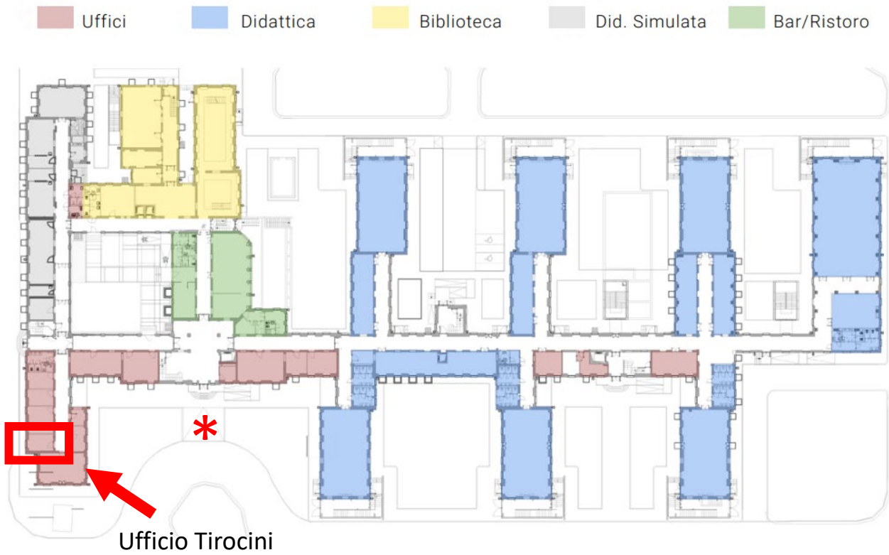
Pianta del piano rialzato del Campus della Salute.